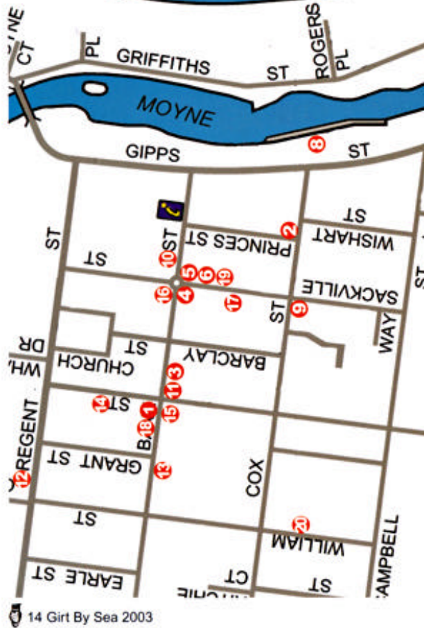
14 Girt By Sea 2003